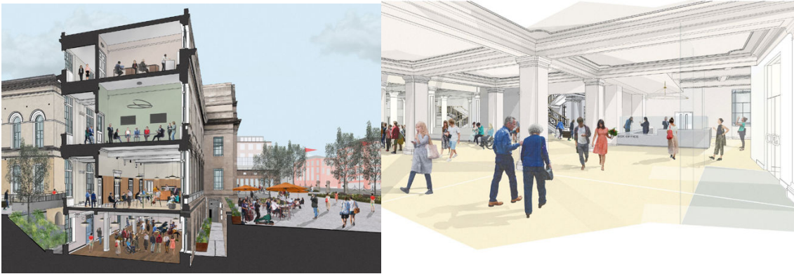
Artist sketches of the North Wing and opened up foyer spaces