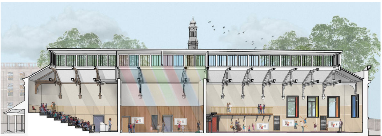
Artist sketch of the proposed Centre for Music Education on Earlsfort Terrace

Our vision is for this historic site in the centre of Dublin to become a great European campus for music performance and learning, for artistic discovery and musical innovation across multiple genres. The new space will host over 2,000 music events and welcome 500,000 visitors every year. It will build a legacy for the future that will make every citizen proud.